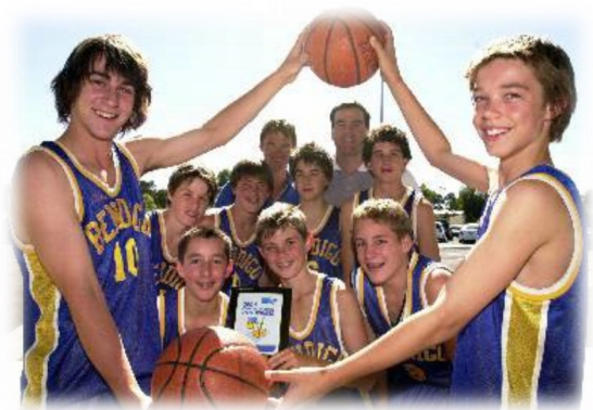
Matt Dellavedova (front right) in his days in the Braves program