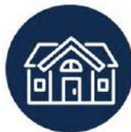
Stay home if you're unwell