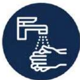
Wash your hands regularly