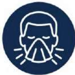
Cover your coughs and sneezes