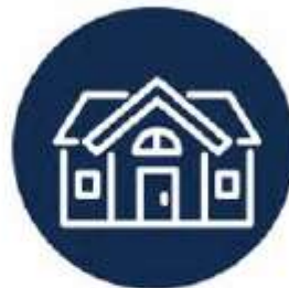
Stay home if you're unwell